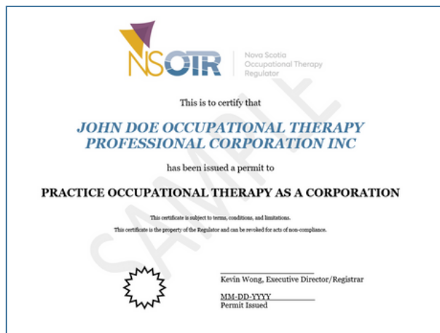
Sample of an NSOTR Corporate Permit

To apply for a corporate permit, please complete the Corporate Permit Application Form, and submit via mail or e-mail to registration@nsotr.ca . The application fee for a corporate permit is $150.